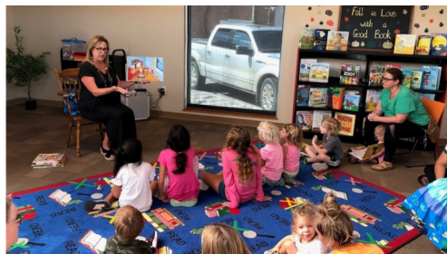
-Children's Story Time Wednesdays 10:30am -Toddler Time Fridays 10:30am