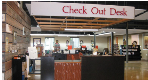
Print, eBooks, Audios, DVDs...