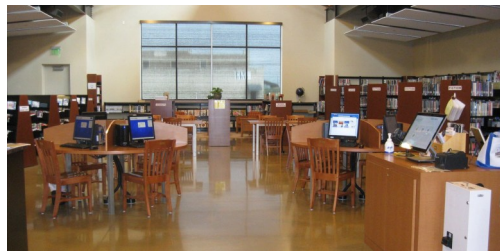
Public Computers, Wi-Fi & Wi-Fi Hotspots